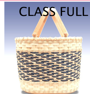
Sa-9 Sat 8:30-5:30 Debbie Hurd Wave Tote 9"H x 12"L x 8"W $65/Int•8 hours

Chase weave with finely prepared black ash splint over a wooden mold and create a half size version of my Diamond Twill Bureau basket. Diamond pattern is visible due to darker heartwood stakes and white sapwood weavers. Good eyesight and previous black ash experience is suggested.