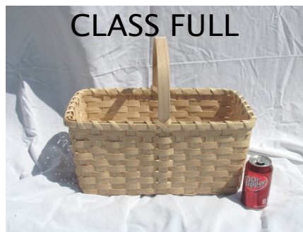
Sa-5 Sat 8:30-5:30 Billy Owens White Oak Small Market 9"H x 15"L x 9"W 15"H w/handle $85/All•8 hours

This large black ash basket is woven using 5/8" uprights and 1/4" weavers. Round spoke bottom will be taught along with rim and handle attachment. This will only be taught once in GA as EAB is infecting black ash in New England. Contact Alice if you would like to prep material in advance of class for a fee.