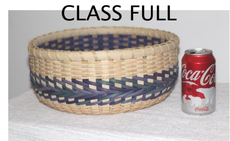
Sa-6 Sat 8:30-5:30 Sandy Bulgrin Caribbean Reef Double Wall 5½"H x 12"D $60/All•8 hours

The Small Market is woven from hand-split white oak that Billy selects, cuts and prepares by hand. The basket has a woven oak herringbone rectangular bottom and oval or rectangular top. It is woven on a class mold.