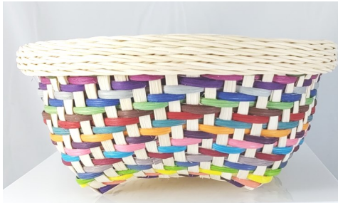
Sa-2 Sat 8:30-5:30 Pam Milat Bowl of Color 4½"H x 9"D $70/Adv•8 hours

Using cane staves, cane weavers and a cherry base, rim and divider students will learn how to do a simple twill pattern in the body of the basket. This basket can be used for outdoor entertaining, to hold napkins and cutlery or makes a great remote control holder.