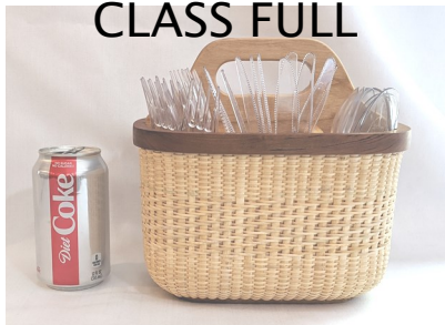
Sa-1 Sat 8:30-5:30 Trisha Brown Utensil Caddy 6"H x 9"L x 6½"W $150/All•8 hours

Using cane staves, cane weavers and a cherry base, rim and divider students will learn how to do a simple twill pattern in the body of the basket. This basket can be used for outdoor entertaining, to hold napkins and cutlery or makes a great remote control holder.