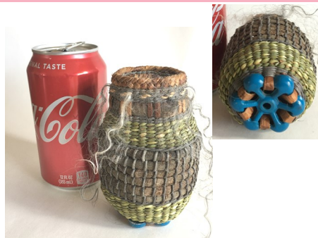
Sa-7 Sat 8:30-5:30 Karen Tembreull Wisp of the Willow 5"H x 2¾"D $115/Int•8 hours

Students will thread a base of cedar bark through a vintage spigot handle. The basket is twined with iris leaves or soft rush and wrapped twined with willow bark and cotton cord. Special tools: flat packer, needle nose pliers, micro clips, old towel, spray bottle, angle cutters.