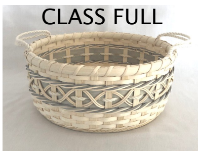
Sa-11 Sat 8:30-5:30 Mary Price Nautical Edge 4½"H x 10"D $50/All•8 hours

The Ditty Bag is woven using cane staves and weavers over a class mold. A combination of traditional and twill weave creates a unique look. Cherry base and rim are pre-finished. Bone knobs, leather handle and choice of liner completes the basket.