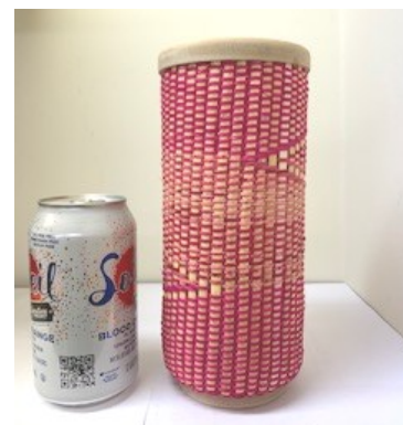
Sa-12 Sat 8:30-5:30 Denise Bendelewski Arrows Vase 7"H x 3¼"D $80/All•8 hours

This nautical theme basket is woven on a slotted round base using natural and dyed grey reed. Techniques include double triple twining, creating double wave embellishments and a single lashed rim with cotton cord filler and handles.