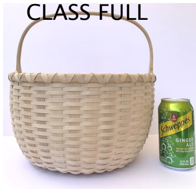
Sa-4 Sat 8:30-5:30 Alice Ogden Once in a Blue Moon 7"H x 12"D 12"H w/handle $195/All•8 hours

The beautiful color filled bowl challenges the intermediate-advanced student with 3 techniques. The base and sides are woven as a 2/2 twill upon a cathead base that's finished with a Gretchen border. Not all students will finish the rim but will have material and instruction to do so. Special tools: spoke weights and gator clips.