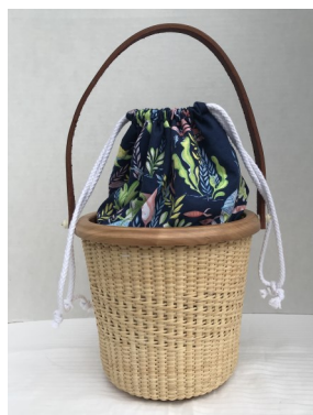
Sa-10 Sat 8:30-5:30 Jan Beyma Ditty Bag 7"H x 7½"D $115/Int•8 hours

Woven on an oval hardwood ash base with two square top button swing handles. Students will learn triple twining and the weave design in the middle. Pattern requires patience and attention to detail. Color choices will be available.