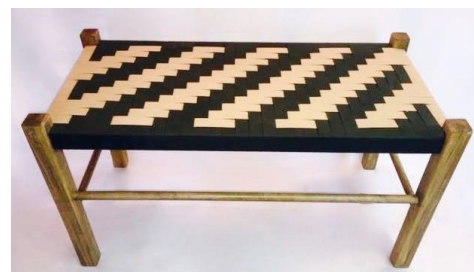
Sa-13 Sat 8:30-12:30 Steve Atkinson Homeroom Bench 17½"H x 32¼"L x 15¼"W 18" Total Height $85/All•4 hours

Using a class mold, cane stakes and weavers are woven on a mahogany base with a simple over under single swirl. The base (top) includes a twine ball knob. Lashed rim completes the Dessert Topper. Basket is pre-started to assure completion. NOTE on registration form if you weave left handed. Tools provided.