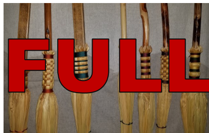
Su-5 Sun 8-12 Bev Larson Cobweb Brooms Size varies $52/All•4 hours

Cobweb brooms are fun and useful. A wide choice of handle options will be available for students to create 2 cobweb brooms—one longer and one shorter. Multiple options for tying the tops of the broom.