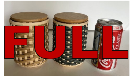
Su-3 Sun 8-12 Sandy Bulgrin Woven Canisters 5"H x 3½"D $28/All•4 hours

Woven on a bent branch or branch elbow handle, this ribbed basket is a unique design. The handle is pre-drilled and preset with ribs, ready to weave. Three point hitch starts the basket, then continues into the rib weaving using dark brown and natural reed. No two alike!