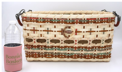
Sa-11 Sat 8:30-5:30 Bonnie Rideout Desert Breeze 9"H x 19"L x 12¾"W $90/Int•8 hours

Weaving on an acrylic mold using hardwood staves, students will use natural weavers to create a Nantucket waste basket that includes a twill accent. Slip on rim. Mold stays in the basket.