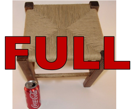
F-6 Fri 1-7 Steve Atkinson Rush Footstool 12"H x 10"L x 9"W $46/All•6 hours

This double wall basket is woven on a twill base, then upset half the stakes for an inner wall and the remainder for an outer wall. The rectangle to oval basket includes 3-rod wale, overlays and is embellished with a yellow sunflower.