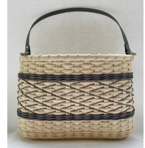
F-3 Fri 1-7 Mary Price New Wave Tote 8"H x 12"L x 7"W 18" H w/handle $85/Int•6 hours

This small round Black Ash basket starts with a cut out star bottom taught in class. Woven with finely prepared 3/32" Black Ash weavers, along with finishing lessons on rim and heart shaped handle. White oak rim and handle. Tools: Small scissors (Fiskars) for cutting star