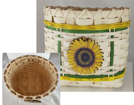
F-5 Fri 1-7 Pam Milat Window of Summer 7"H x 7½"L x 6"W $60/All•6 hours

Students learn to set up a Nantucket basket on a class mold and incorporate a twill weave. Basket is woven with cane staves and weavers, and includes pre-finished Cherry base, rim and lid.