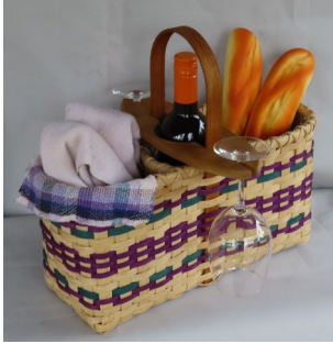
F-1 Fri 1-7 Bev Larson Cheese & Wine Sm Picnic 10"H x 16"L x 6"W $72/All•6 hours

Start with a round basket to hold a wine bottle, then weave a rectangle basket for it to fit in. Basket can hold a bottle of wine and your picnic items or 3 bottles of wine. Color highlight options will be available.