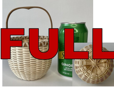
F-2 Fri 1-7 Alice Ogden Georgian Star 3½"H x 4½"D 6" H w/handle $145/Int•6 hours

Start with a round basket to hold a wine bottle, then weave a rectangle basket for it to fit in. Basket can hold a bottle of wine and your picnic items or 3 bottles of wine. Color highlight options will be available.