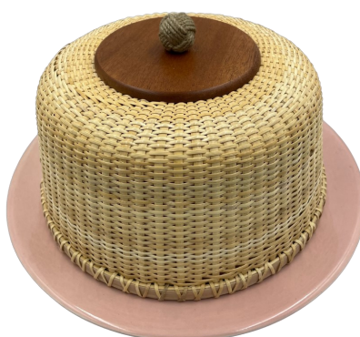
Sa-12 Sat 8:30-5:30 Jan Beyma Dessert Topper 6½"H x 11"D $98/Int•8 hours

Using a class mold, cane stakes and weavers are woven on a mahogany base with a simple over under single swirl. The base (top) includes a twine ball knob. Lashed rim completes the Dessert Topper. Basket is pre-started to assure completion. NOTE on registration form if you weave left handed. Tools provided.