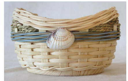
Su-6 Sun 8-10 Mary Price Sea Shore 3½"H x 5"D $25/All•2 hours

Cobweb brooms are fun and useful. A wide choice of handle options will be available for students to create 2 cobweb brooms—one longer and one shorter. Multiple options for tying the tops of the broom.