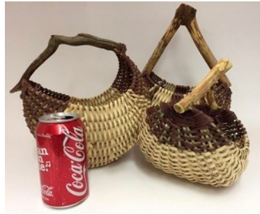
Su-2 Sun 8-12 Sandy Atkinson Bent Branch 8-10"H x 7-10"W $55/All•4 hours

Weaving on a class mold, students will create a Nantucket style basket while weaving a copper wire along side the natural weaver. A Cherry base, slip on rim and handle complete this treasure.