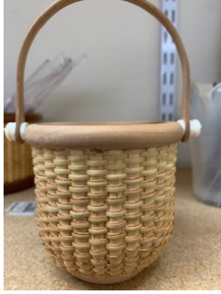
Su-1 Sun 8-12 Denise Bendelewski Copper Mine 3½"H x 3"D $80/All•4 hours

Weaving on a class mold, students will create a Nantucket style basket while weaving a copper wire along side the natural weaver. A Cherry base, slip on rim and handle complete this treasure.