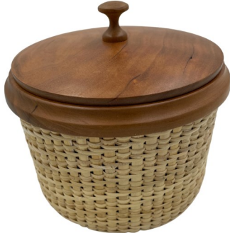
F-4 Fri 1-7 Jan Beyma Trevor's Sweet Stash 4"H x 5"D $90/Int•6 hours

This sturdy, functional slim tote starts with natural reed spokes inserted in a race-track base. Techniques include triple twine w/step up and a wave weave design. Finish with double-faced leather handles.