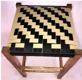
Su-4 Sun 8-12 Steve Atkinson Kingston Bar Stool 27"H x 17"L x 17"W $83/All•4 hours

Let's make 2! The airtight canister is woven over a glass cylinder on a wood base. Natural spokes and dyed reed in a continuous weave creates different patterns. Many colors of dyed reed to choose from plus an air tight wooden lid.